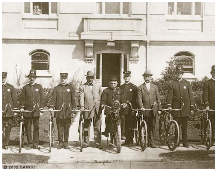
View of nine men from the Sacramento Police Department posing in front of the police station in September, 1911 with their bicycles

Collectively, the projects address issues of standards and arrangement of finding aid descriptive elements, digitization of archival materials for presentation on the World Wide Web, and methods of engaging the public in discussions about primary sources. The participants will discuss goals, funding sources, benefits and challenges of working with collaborators, technical issues, and current status of each project.