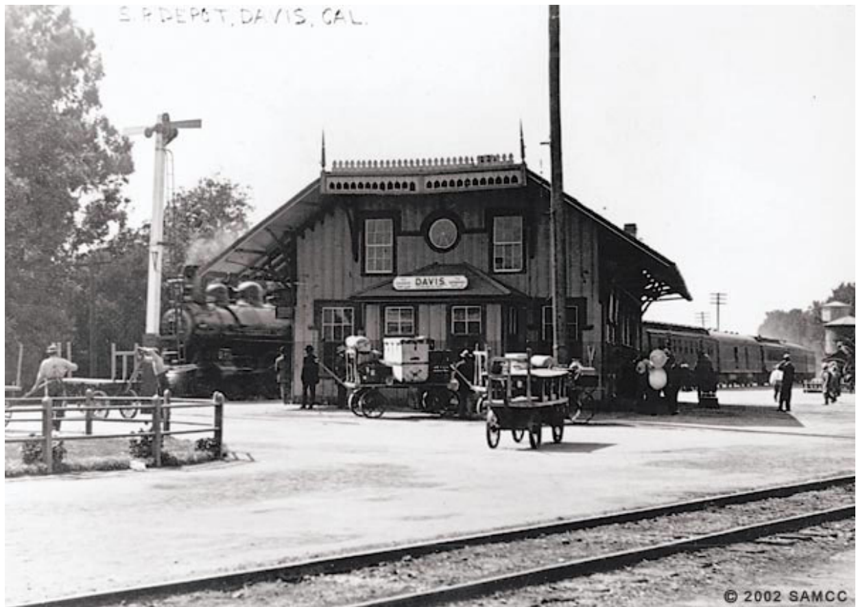
View of the Southern Pacific Railroad depot at Davis, California, ca. 1900-1909.

Join old friends and make some new ones at the Capitol Plaza Holiday Inn. After the reception you may want walk to nearby Old Sacramento to dine. See the Registration Desk for suggestions.