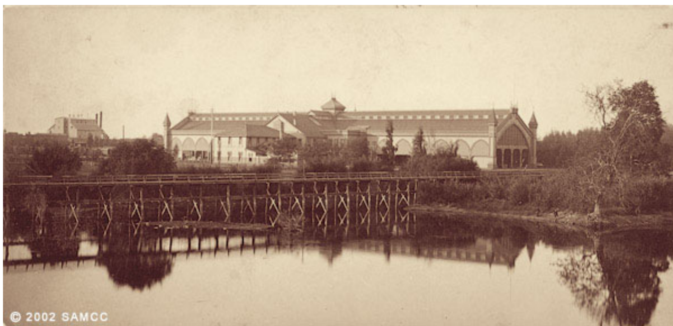
View is of Southern Pacific Railroad Company's depot at 5th or 6th Street and I Street. Courtesy of the Sacramento Archives and Museum Collection Center.

Cover photograph: Sacramento street scene looking west down K St. from 11th during business hours. Courtesy of the Sacramento Archives and Museum Collection Center.