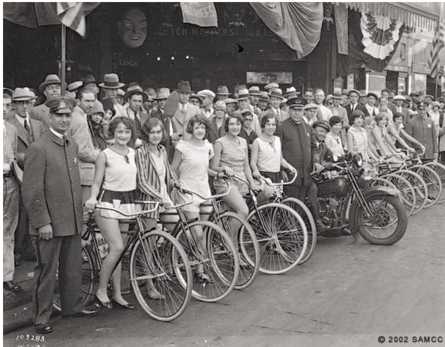
Fox Senator Theater Chorus Line on bicycles.