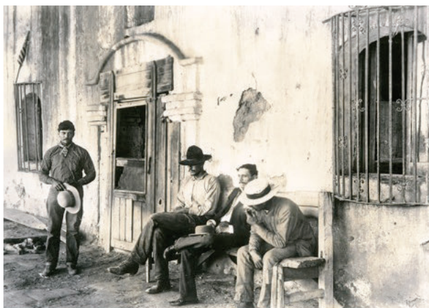
Reflections at the Convento, c.1890s

The A.A.L.A.'s main collection of analog images of Mission San Fernando is comprised of approximately 40 three-ring binders that contain photographs, negatives, transparencies, post-cards, and illustrations. While original sets include comprehensive coverage of various rebuild-ing projects or major events like the 1971 Sylmar earthquake, the assemblage is also illustrative of several prominent late-19th and early-20th century photographers and studios such as Carleton E. Watkins, A.C. Vroman, Frederic H. Maude, and the "Dick" Whittington Studio among others.