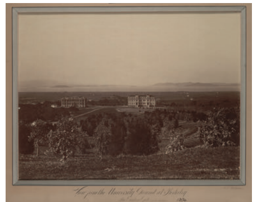
View from the University Ground at Berkeley: The Golden Gate. By Carleton Watkins, 1874.